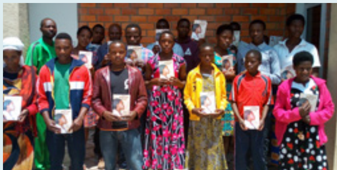
Blessed by GNU's gospel meetings and Christ-centred books

Sharing the Gospel at Christmas Recently, the Kenyan Government initiated some prison reforms designed to give